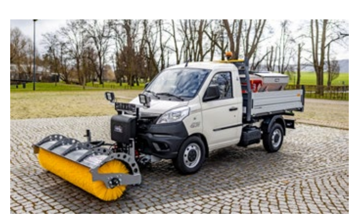
SweepAway<sup>™</sup> rotary broom on pickup