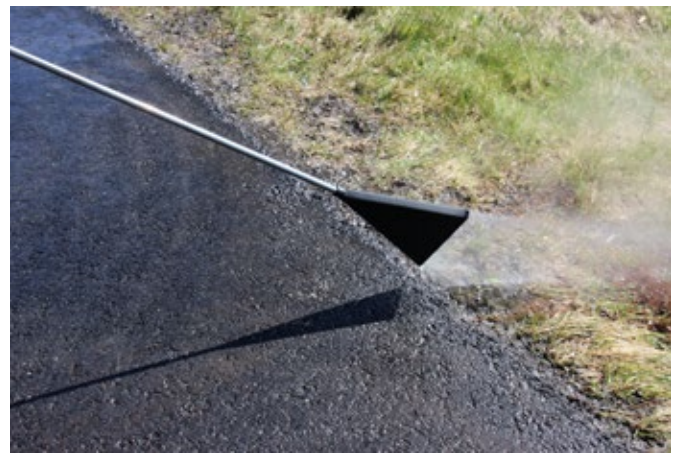
Optional weed control nozzle kit WD 01