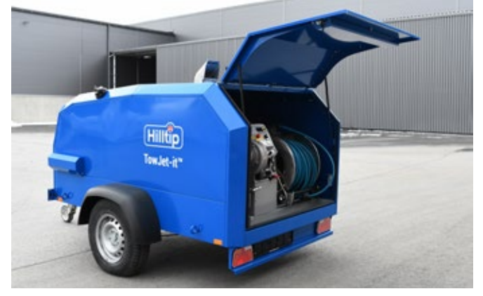
TowJet-it<sup>™</sup> towable hot pressure washer