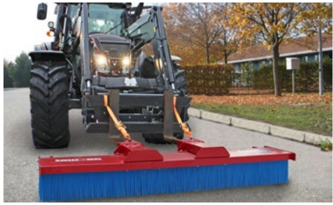
SweepAway<sup>™</sup> medium series, with 12 brush rows