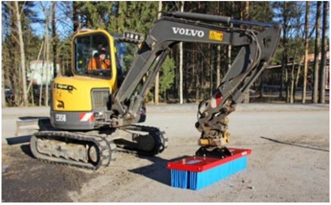
SweepAway<sup>™</sup> on excavator