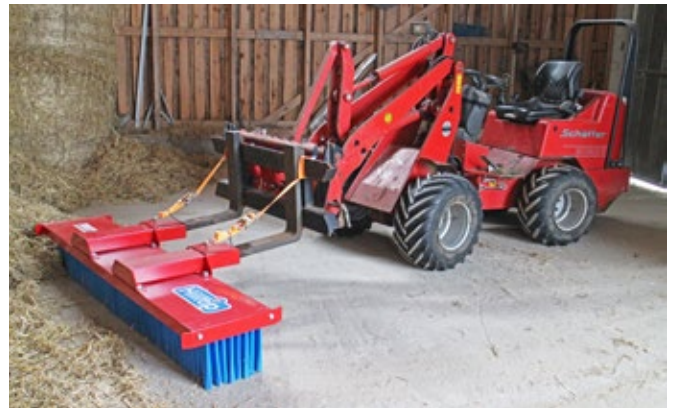
The SweepAway™ can handle a variety of materials, such as leaves, sand, rocks, debris, snow, slush etc.