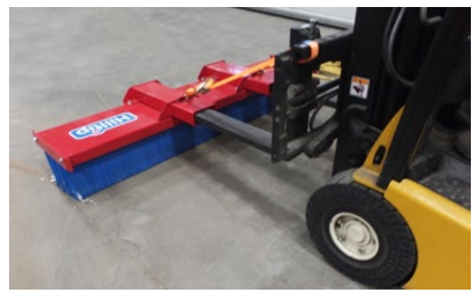
SweepAway<sup>™</sup> with attachment for forklift