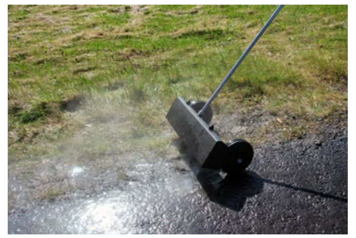
Optional weed control nozzle kit WD 04